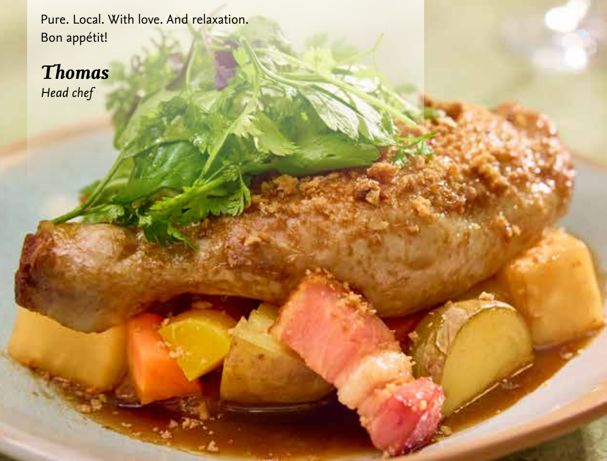
Coq au vin