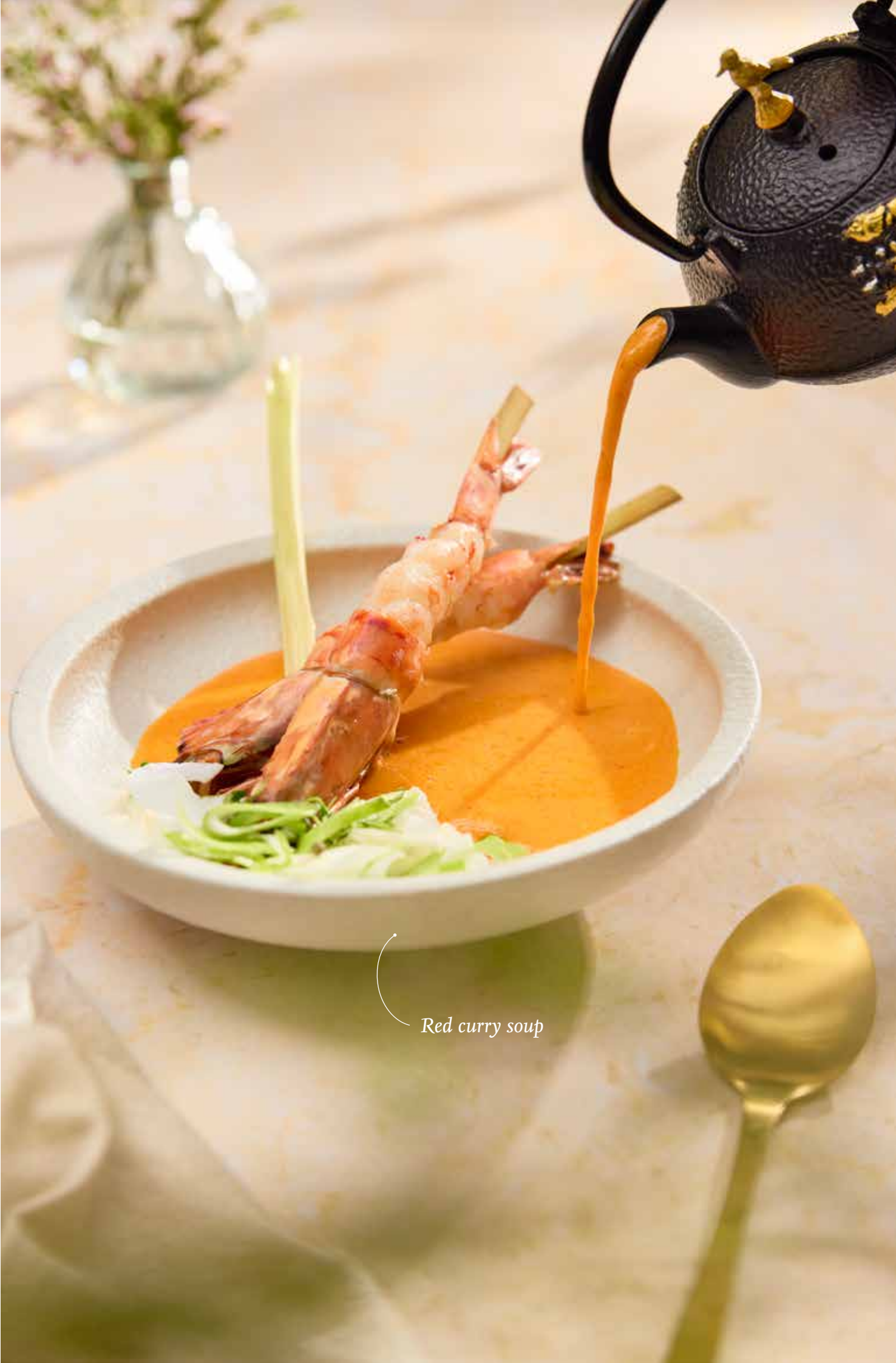
Red curry soup